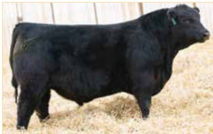
Allison Seminole 121J : Sire to 265, 266, 268, 269 and 272