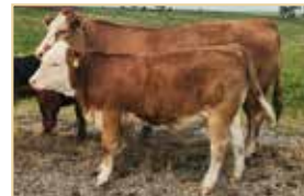
Southpaw Cattle Co.