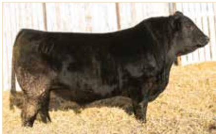
Black Wheel Dracarys 86G : Grandsire to 265, 266, 268, 269 and 272