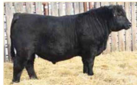
Richmond Jentry SRD 4J : Sire to 310, 312, 314, 322, 330 and 331