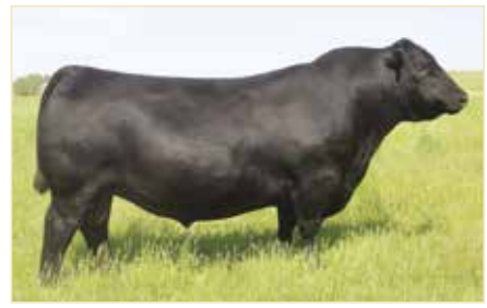
S A V Rainfall 6846 : sire of Lot 199