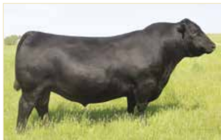
S A V Rainfall 6846 : sire of Lot 199